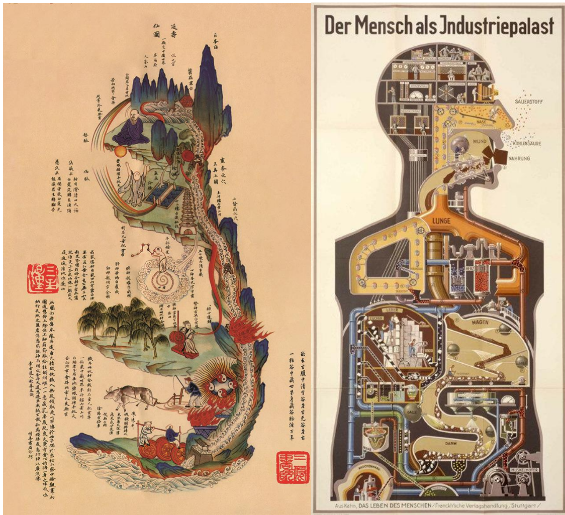
fig. 1: The diagram Neijing tu (Nèijīng tú 內經圖) with printed Chinese characters (left) and (right) the poster Der Mensch als Industriepalast 3